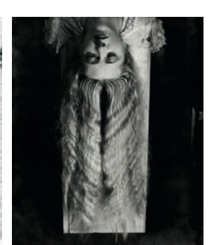
Man Ray, Woman with Long Hair, 1930