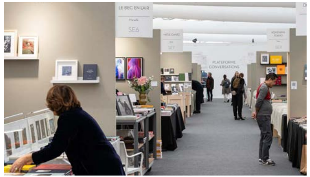
Paris Photo 2022 - Edition