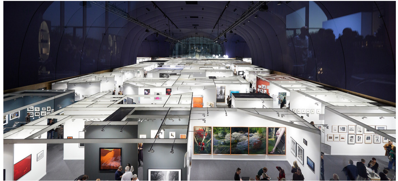
Paris Photo 2022 - Principal

PARIS PHOTO IS ORGANIZED BY RX FRANCE, A DIVISION OF RX 52-54, quai de Dion-Bouton - 92806 Puteaux Cedex - France Tel: + 33 (0)1 47 56 50 00 - info@reedexpo.fr - www.rxglobal.com